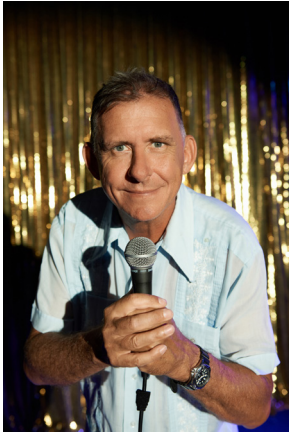
MC PETER ROWSTHORN

Peter Rowsthorn is a high-energy, fast-paced stand-up comedian one minute and a measured character actor the next. He is best known as the long-suffering husband and pants-man Brett Craig on Kath & Kim. Peter's career really took off in 1988, when he was offered roles in The Comedy Company, Fast Forward and The Big Gig, all in the same week. After performing in the feature film crackers, he became a semi-regular on Hey Hey It's Saturday and hosted the Red Faces spin-off gonged but not forgotten. He was also the host of Foxtel's sunday roast for two seasons.